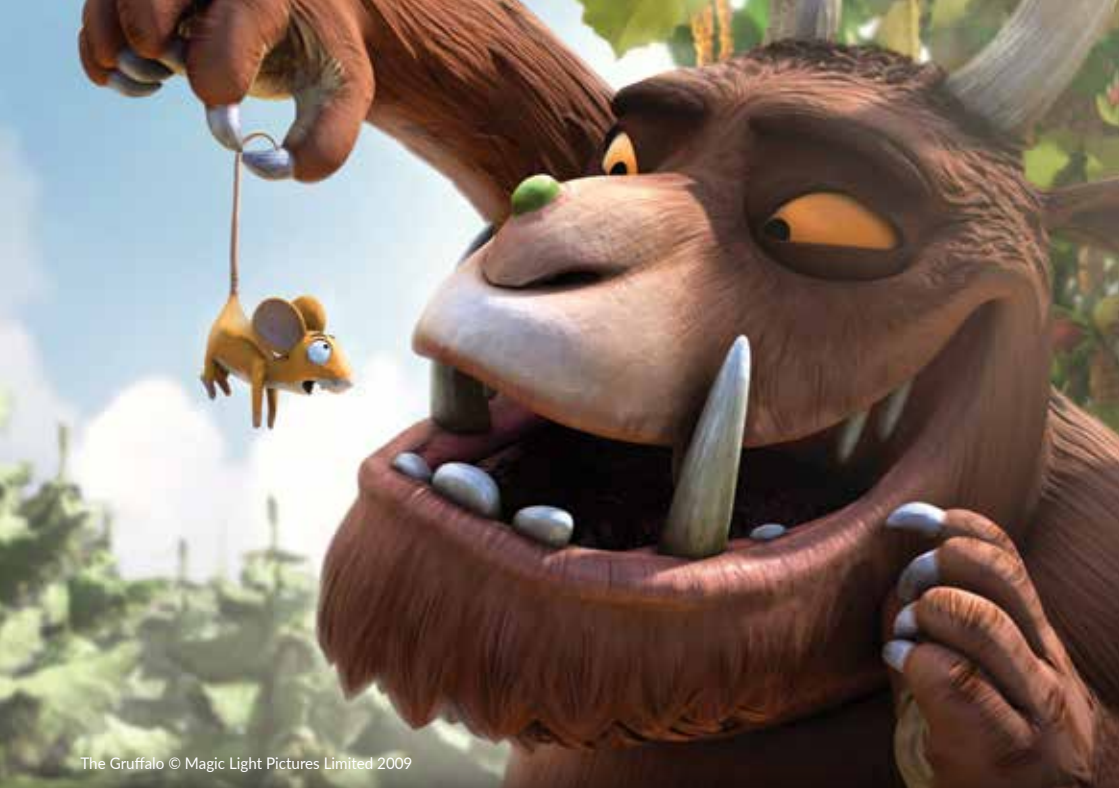
The Gruffalo