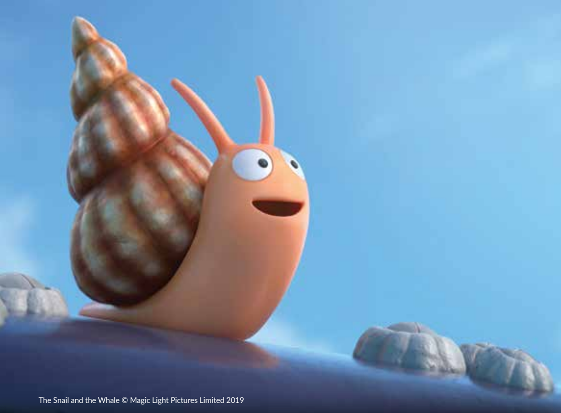
The Snail and the Whale © Magic Light Pictures Limited 2019