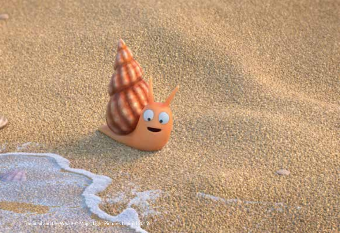
The Snail and the Whale